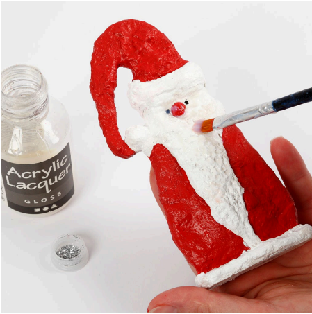
10 Apply a coat of transparent acrylic lacquer to strengthen the surface. Sprinkle silver glitter in the wet lacquer around the face, the beard and the stand.