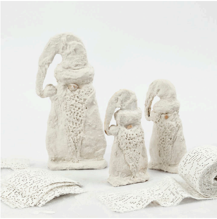
11 The wooden figure on a stand is available in two sizes. The small ones are cute as decoration next to the person's place setting, while the large ones can be used for decoration on the Christmas table.