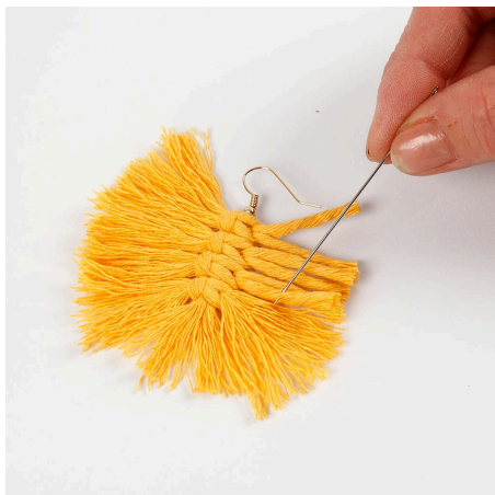
7 Unravel the cords with a needle.