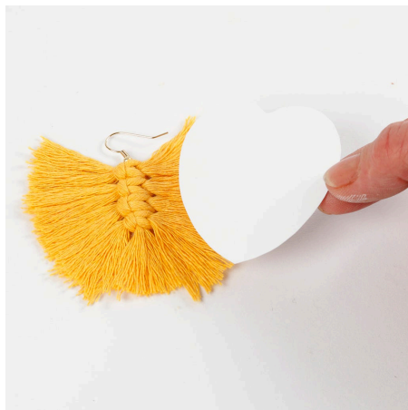
8 Print or draw a template.