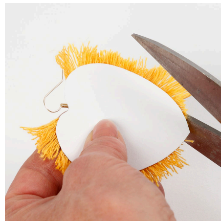
9 Trim the leaf using the template.