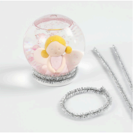
9 You may decorate the snow globe further with three rings made from pipe cleaners around the lid.