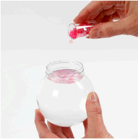
7 Pour water into the snow globe and sprinkle glitter and sequins into the water.