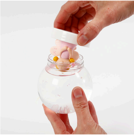
8 Glue the Fimo angel onto the inside of the snow globe lid and screw on the lid.