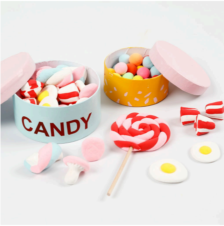
14 See idea No. 16182 for how to make boxes for the sweets.