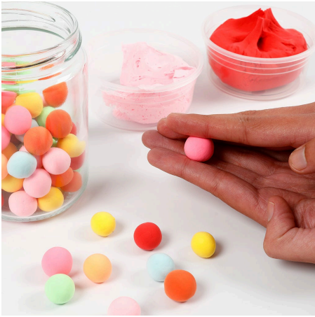
13 Make bubblegum balls by rolling Silk Clay balls in some of the remaining colours.