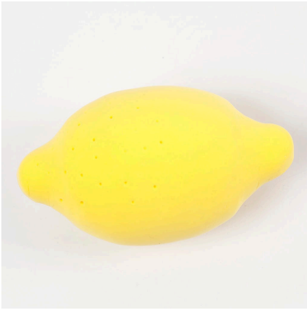
19 Make a lemon by pushing flat rolled-out yellow Silk Clay around a polystyrene ball. Attach a thick piece of Silk Clay to each end to give the lemon its characteristic shape. Make dots with a wooden flower stick.