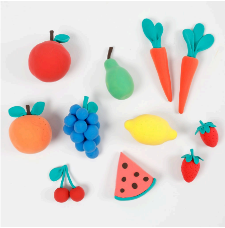
20 Here are the finished fruit and vegetables.