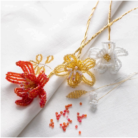
10 Flowers made from different coloured beads.