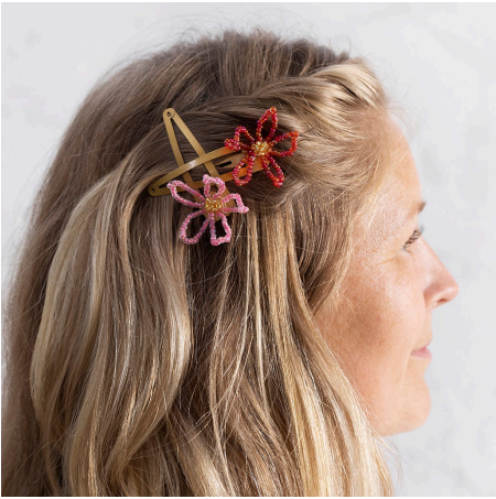
11 Hair clips with beaded flowers.