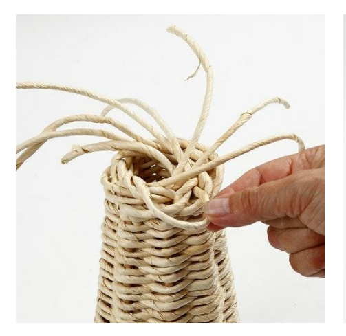
16. From the inside take out every maize cord and push it in again through the 3rd loop. Tighten.