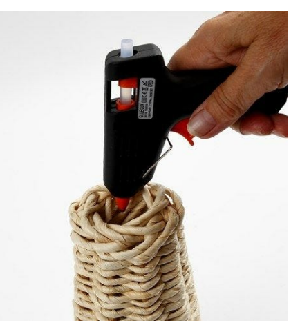
17. Tighten the weaving and trim all the ends at approx. 2-3cm. Push these into the edge all the way along. Use glue to secure the ends.