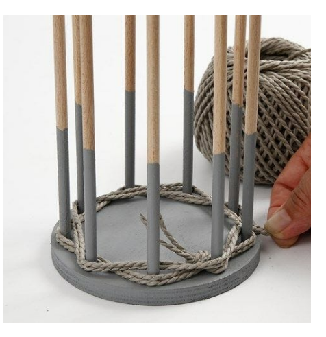
6. Weave the doubled-over paper yarn alternately behind and around each wooden stick as shown.

5. Use paper yarn for weaving the first section of the basket from the base. Double over the paper yarn, tie a knot at the end, twist it slightly and attach it around a wooden stick as shown.