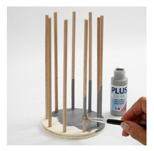
4. Paint 1/3 of each wooden stick with Plus Color craft paint. Also paint the wooden basket weaving template and the edge.