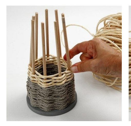
10. Tighten the maize cord each time you weave around a wooden stick.