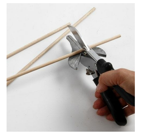
1. Utilisez des bâtons de bois d'une longueur de 30cm pour la confection du plus grand panier et utilisez des bâtons de bois raccourcis à 20cm pour la confection du petit panier.

Ces grands paniers sont faits de bâtons de bois ronds, insérés sur le pourtour d'un modèle pour panier à tisser. De la ficelle de papier et de la corde de maïs sont utilisées pour le tressage entre les bâtons de bois.