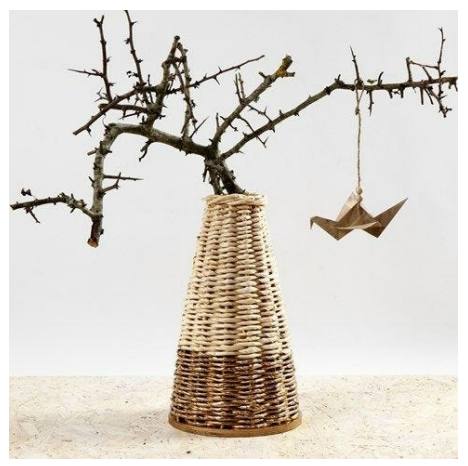
Another variant -