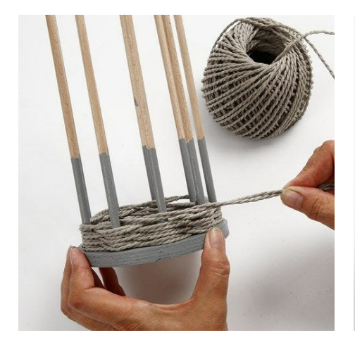
7. Twist the paper yarn as you go along to ensure that it has the same thickness as that of the maize cord which will be replacing the paper yarn later in the weaving.