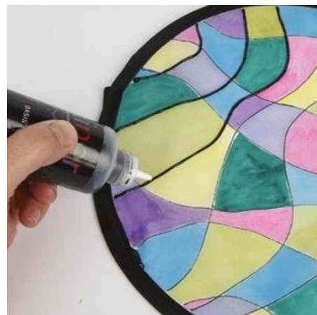
3 Draw up the lines with a 3D liner.