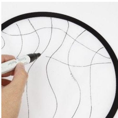
1 Draw lines.