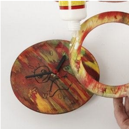
10 Glue the ring to the clock face.