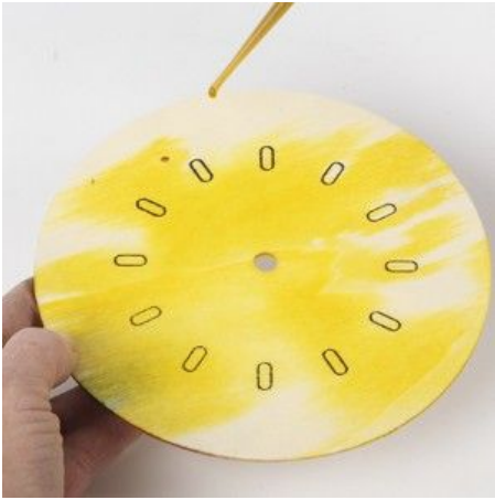
7 Use the same procedure for the clock face.