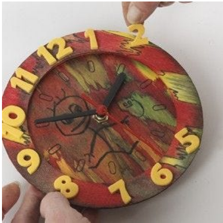
11 Put on numbers and mount the clockwork. Read the instructions.