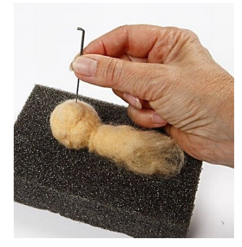
4. Needle felt a head/neck with a slightly large nose.

3. Sew the two thick felt hearts together using blanket stitches.