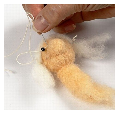
6. Sew on small rocaille beads as eyes.

5. Shape wool for hair which is tied to each side. Needle felt the hair onto the head.