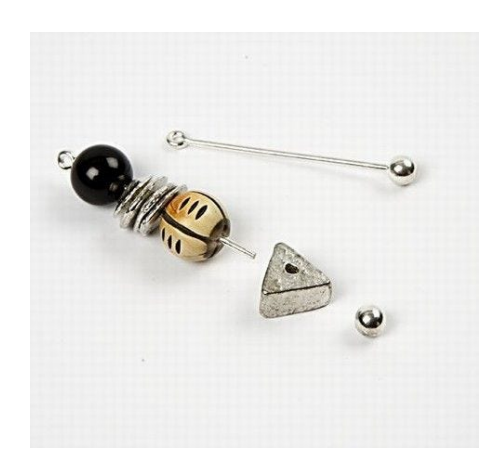
1 Thread beads onto the drop pin and close. Attach a round jump ring onto the eye of the drop pin.