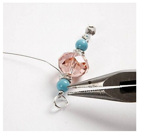
3 Thread the wire through a round jump ring, back through the crimp bead and a bead. Squeeze the crimp bead flat and cut off excess wire.