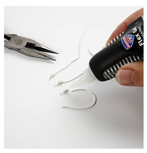
4 Cut three pieces of chain and glue them in place with Super Attak Instant Glue in their individual end caps. Squeeze the end cap slightly flat.