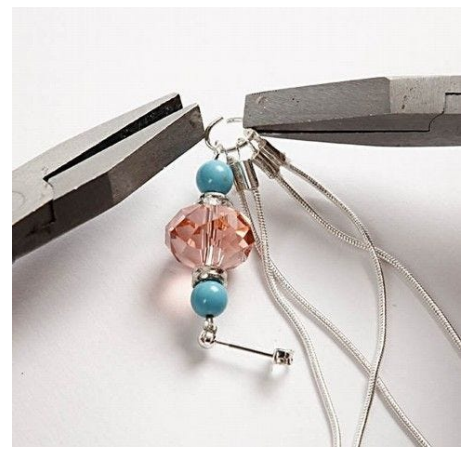
5 Gather all the parts in a round jump ring.