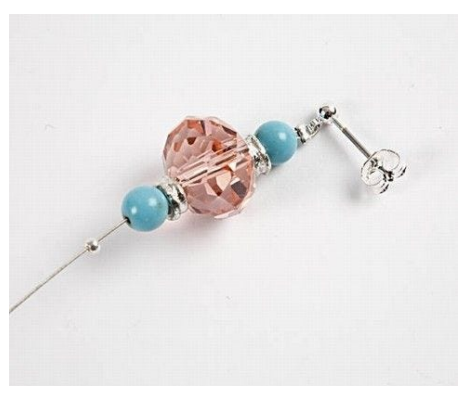
2 Thread beads and metal discs onto the beading wire and finally a crimp bead.