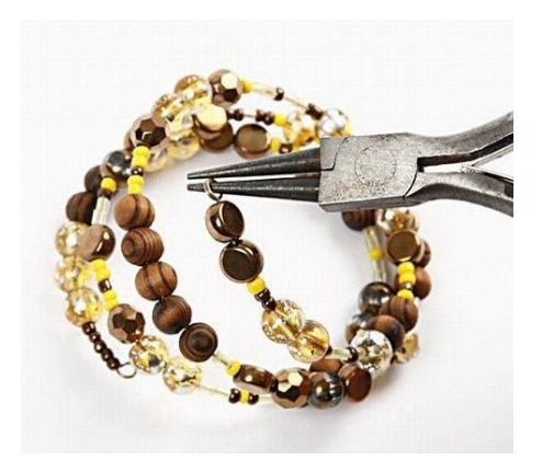
4 Finish off by making another loop.