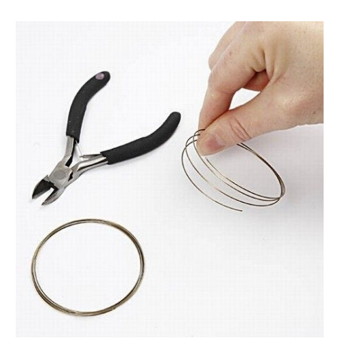
1 Cut three rounds of memory wire.