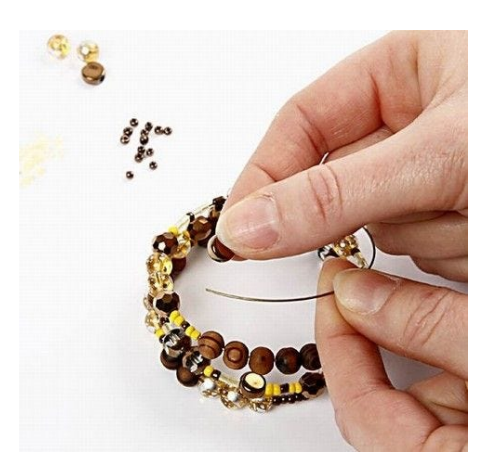
3 Pull on beads in the desired order.