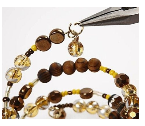
Attach a round jump ring in the pendant and attach it in the loop at the end of the bracelet.