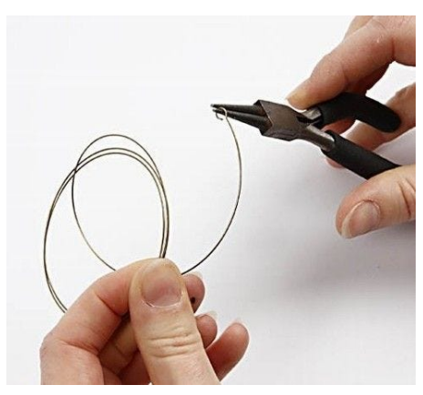
2 Make a loop in one end with round nose pliers.