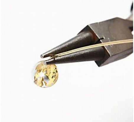
5 Make pendants like this: Put a head pin through a bead and bend the pin towards you.