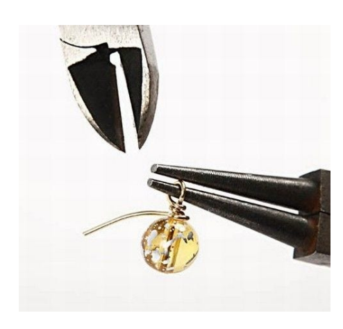
Turn the pin around three times as shown and cut off the excess pin.