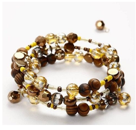
If you wish, you can attach more pendants by attaching a round jump ring onto the memory wire itself and then attach a pendant to the round jump ring.