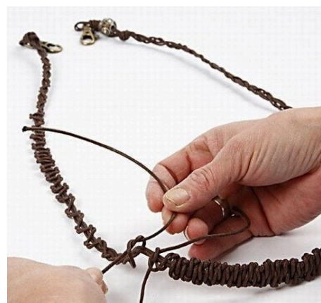
24 Now plait up towards the first plait.