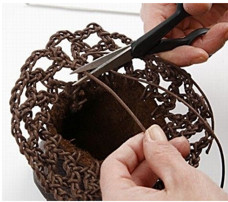
17 Fasten the end securely.