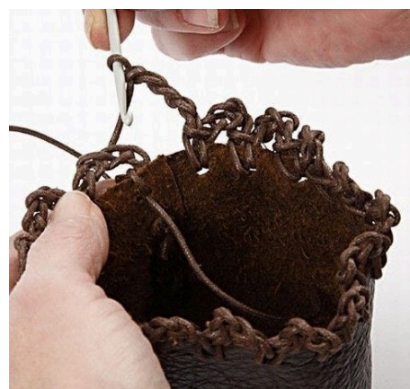
15 Crochet seven chain stitches in each hole.