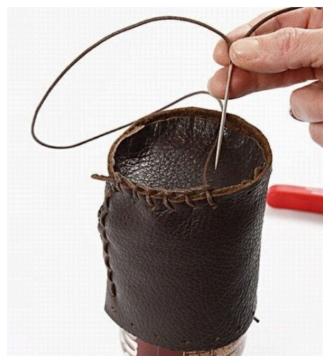
12 Sew the bottom on using buttonholing stitches.