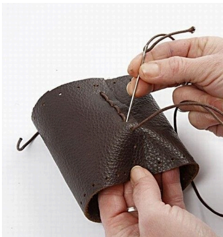
8 Cut a piece of cord measuring approx. 2.5 m. Sew the sides together, starting in the second hole.