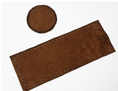
7 Ready for sewing.