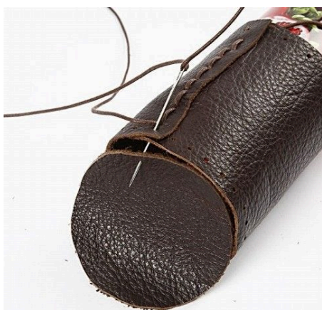
10 Insert the needle through the bottom and pull the string tightly to make it easier to manage the leather when making the holes. Fasten the last stitch temporarily.