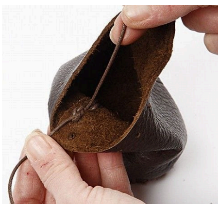
14 Crocheting the edge. Tie a piece of cotton cord onto the upper stitch.