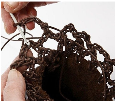
16 Der hækles i alt 3 omgange.