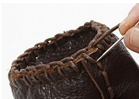
13 Finish the last hole and tie a knot on the inside.