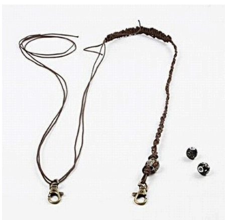
23 Attach a swivel clasp onto the other end.