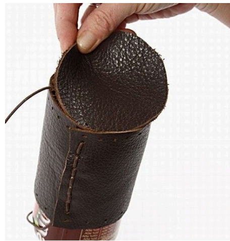
9 Insert the base.