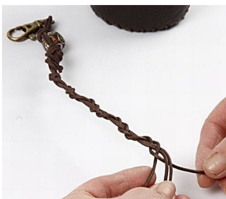
20 Plait around the two cords – approx. 1 meter.