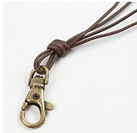
18 For the strap; cut 2 pieces of cord each measuring 4.5m. Attach the swivel clasp onto the middle of the cords. Double over and tie a knot.