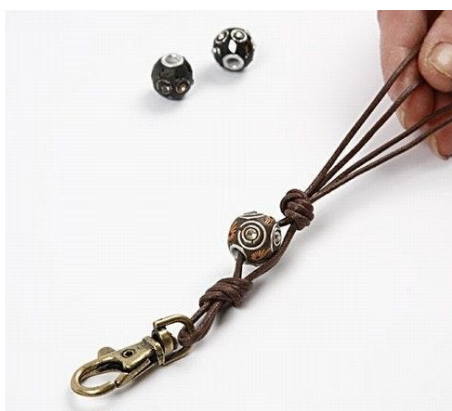
19 Pull a bead onto two of the cords and tie a knot.