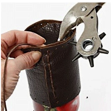
11 When making holes in the base, use the holes made in one end of the sewn cylinder. Make sure the bottom does not slip.