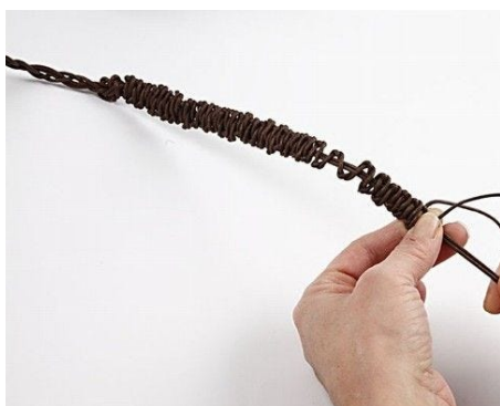
22 Push the plait together and tie a knot.