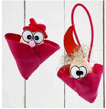
Quirky gnomes in hiding Heads of cotton egg glued into a felt cone. Funny eyes glued onto the head and pipe cleaners used as pixie hats. Hair made from gold lametta.