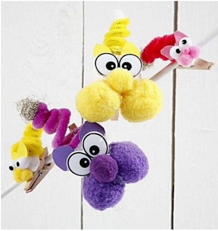
Flying imaginative animals Cotton eggs used as the head, pom-poms and pipe cleaners glued on with funny eyes. Finally put onto a peg.