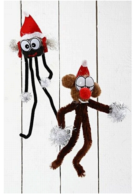
Disco pixies Pixies made from pipe cleaners, head and hands made from pom-poms and hats made from felt.