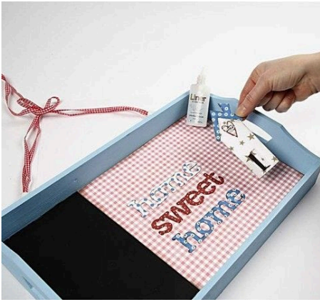
7 Attach paper or card onto the tray with 3D-Liner.