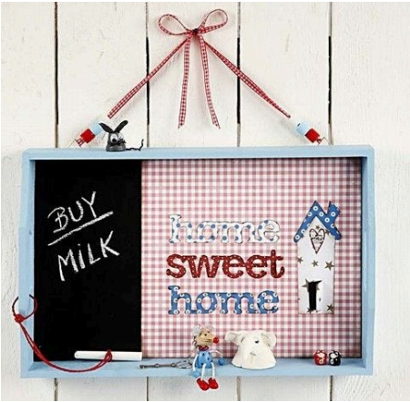
8 Tie a piece of chalk onto one handle and put on a few decorative items