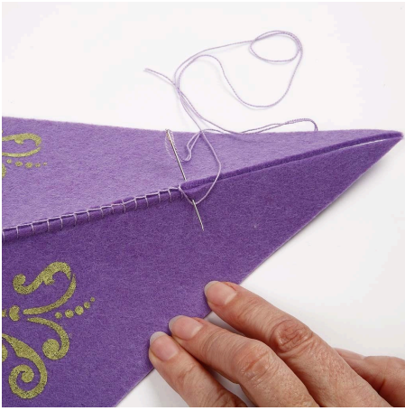
4. Sew the three sides together using buttonhole stitches.