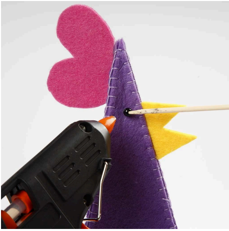
6. Glue/sew on wooden beads for eyes.