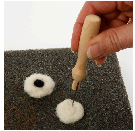
6 Take a small piece of white wool for the eyes. Fold the edges towards the middle and felt. Felt two of the eyes a little flat and the other three eyes a little round.