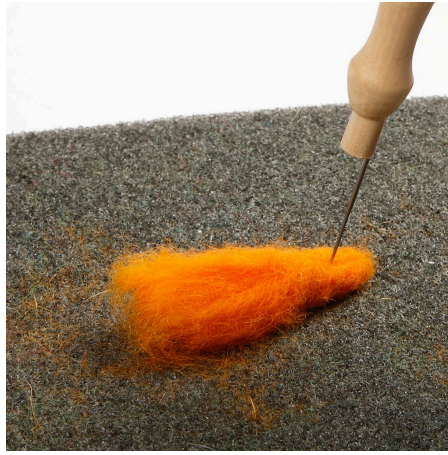
5 For the horn fold a small amount of wool and felt whilst turning.