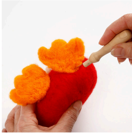
8 Felt the feet onto the body from underneath.