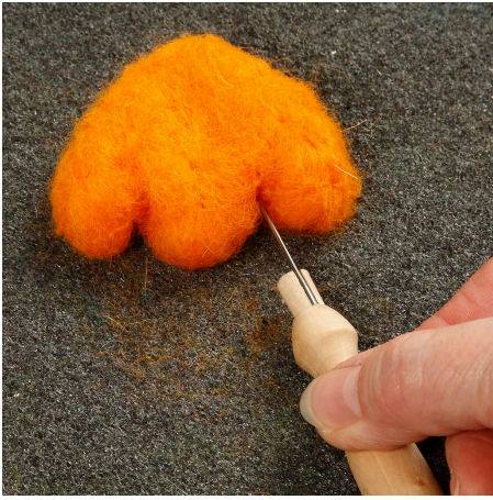
4 Felt where you want the wool to make the toes.