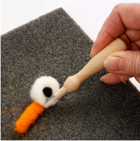
7 Felt the eyes onto the horn.