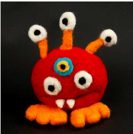
10 This is how a monster could look, but use your imagination.