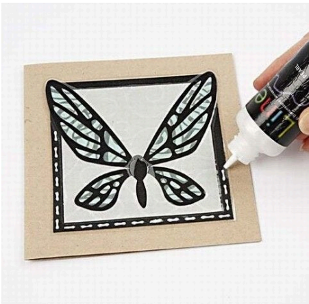
10 Decorate and write the name with 3D liner.