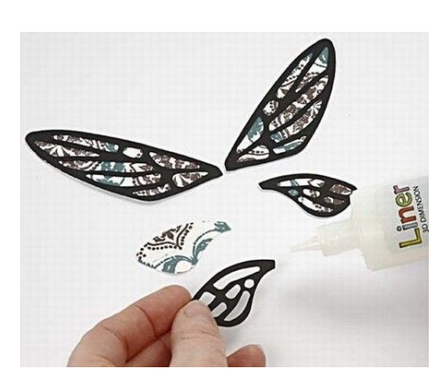
4 Glue the parts with Clear Marker.