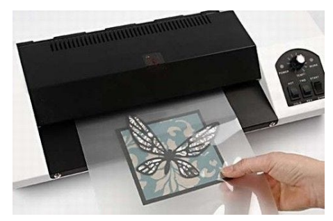
6 Run carefully through the laminating machine.