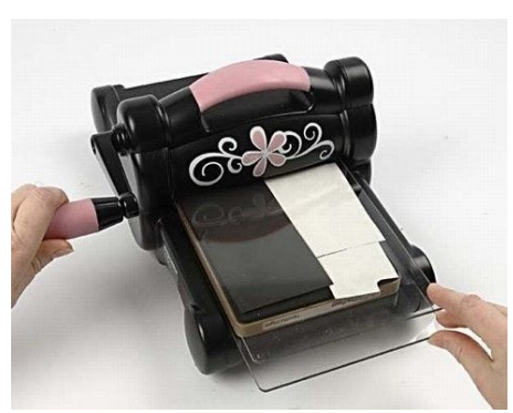
2 Run the whole assembly through the Big Shot die-cutting machine.