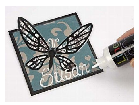
8 Write the name with 3D liner.