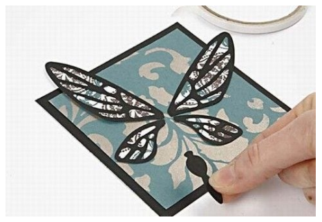
5 Cut a piece of black card measuring 11 x 11cm and a coloured piece of card measuring 10 x 10cm. Assemble the two cards and glue the butterfly parts together with double sided adhesive tape.