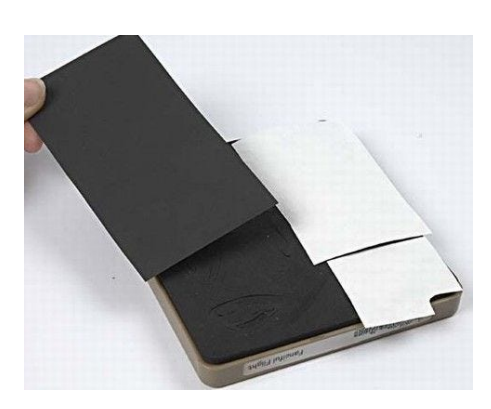
1 Put black coloured paper onto the die. Put an acrylic cutting pad above and below.