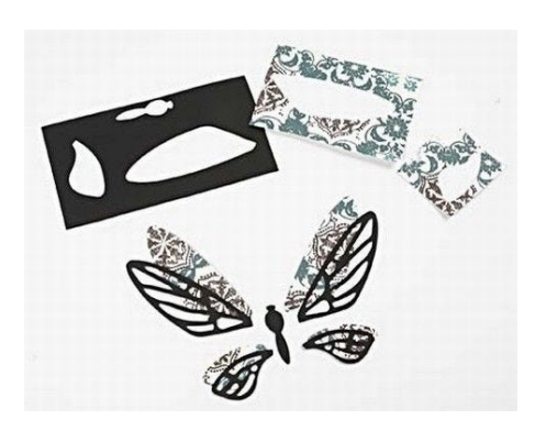
3 Assemble the parts.