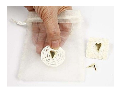
4. Push the legs of the metal heart through the satin decoration and organza bag. Put the gold body inside the organza bag and tie the ribbon in a bow in front.