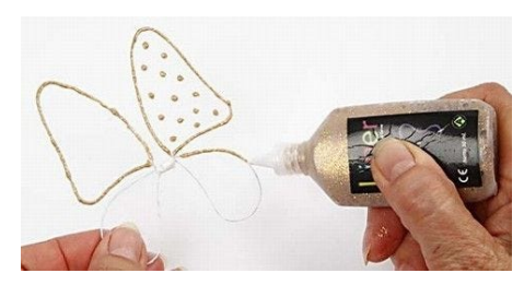
7. Draw along the edges of the wings using a 3D gold liner and add decorative spots. Let dry.