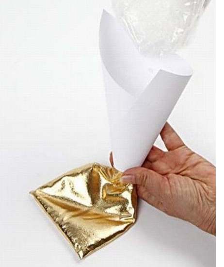
2. Fill the body with plastic pellets at the bottom.