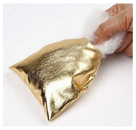
3. Stuff with polyester stuffing. Sew or glue together at the top.