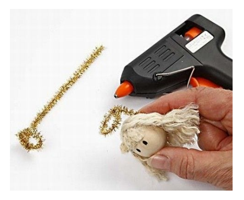
6. Form a halo from a pipe cleaner and glue it on.

5. Draw eyes using a permanent marker. Cut natural twine as shown and glue on as shown. Fray using a needle.