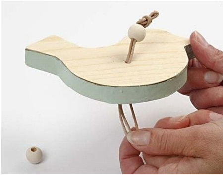
8 Insert the cord end into the hole of the lid.