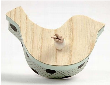
9 Attach another wood bead onto the leather cord from the inside of the lid. Glue it on on the inside of the lid.