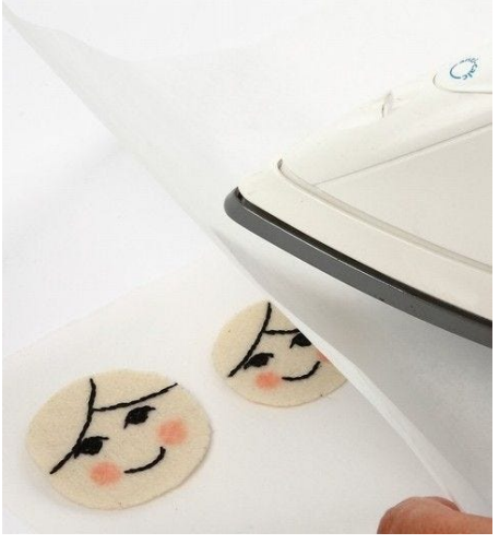
6. Iron Vliesofix on the back of the felt face.

5. Colour the cheeks with a red colouring pencil.