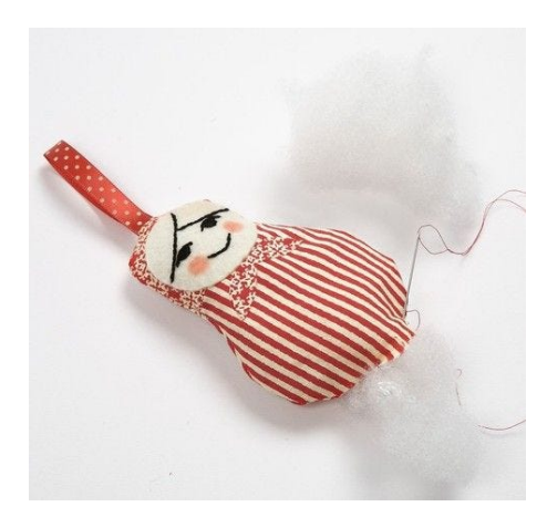
10. Fill the body lightly with polyester stuffing and sew together.

9. Fold a piece of ribbon; place it between the two body parts and sew together, leaving a 3cm hole at the bottom.