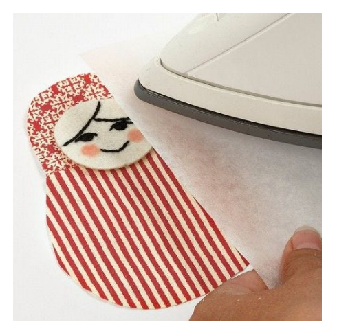
7. Remove the protective paper and iron the face onto the body.