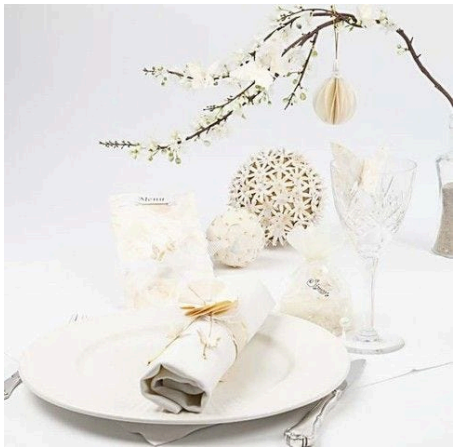
9 Decorate the thread for hanging with mother-of-pearl plastic beads.