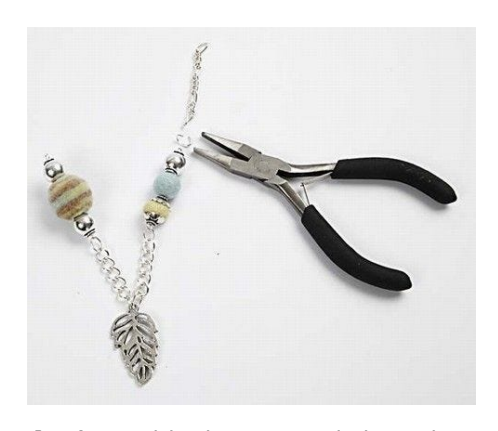
4. Assemble the various links with oval rings.