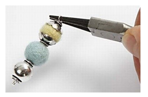
3. Close the eye pin by twisting to make a loop using round nose pliers.