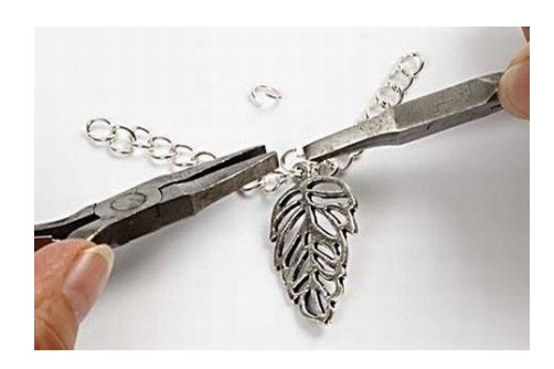
1. Assemble pieces of jewellery chain with pendants using oval rings.