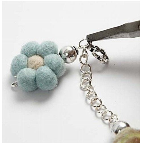
5. Attach leaf pendants and wool beads with bead caps onto the chain with an oval ring.