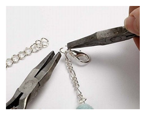
6. Fit a clasp – depending on the length – with an oval ring.