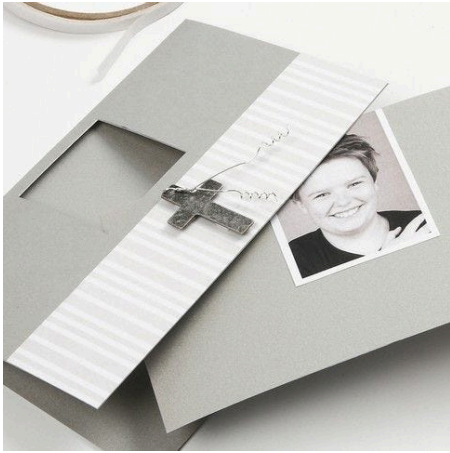
5. Print out a photo and glue it onto a piece of pearlescent card which fits the front of the card. Glue this inside the card.