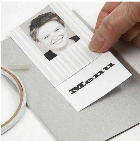
7. Divide a card into two for a menu card and a place card: 10cm and 5cm. If a large number of place cards is required, divide the card into three.