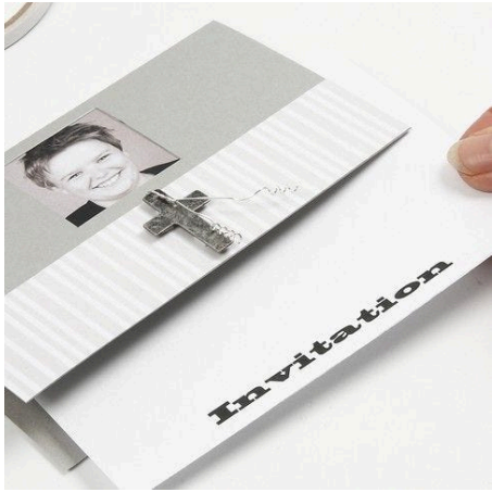
6. Attach a piece of printed photo paper – the same size as the back of the card – using double-sided adhesive tape. Print out the menu or write it with a silver gel pen.