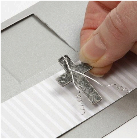
4. Attach the cross onto the card with 3D foam pads.