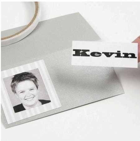
8. Assemble the cards in the same way as the invitation with Skagen Paper, photocopies and texts.