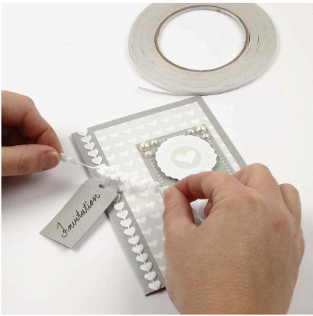
7. Attach the small tag.