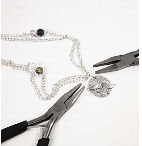
8. Finally attach a pendant with an oval jump ring.