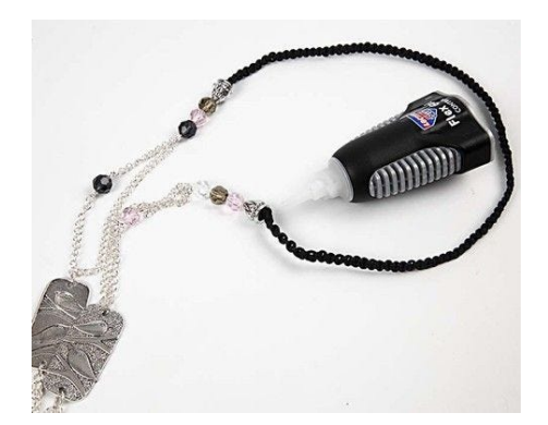
7. Finish the necklace by connecting it to the braided cord.