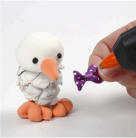
8. Glue on the bow with a glue gun.