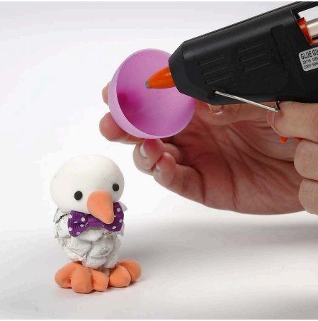
9. Glue on the egg shell with a glue gun.