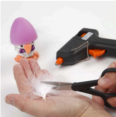
10. Cut off the tip of a turkey feather and glue it onto the back of the chick.