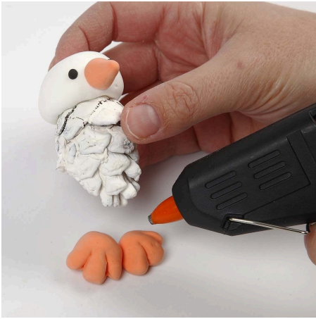
7. Glue on the feet with a glue gun.