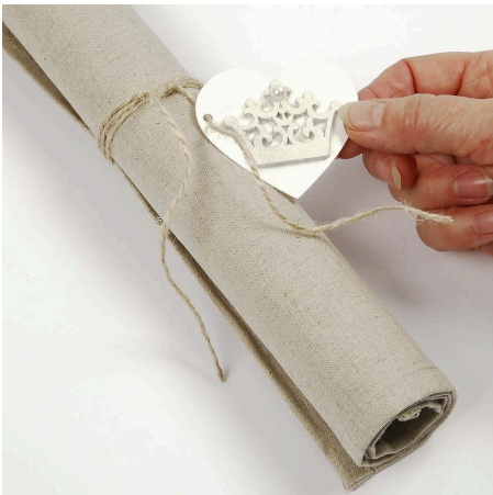
10. For the napkin ring use a punched out cardboard heart, a crown, self-adhesive rhinestone half-pearls and a piece of string.