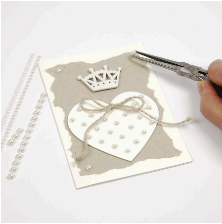
7. Attach a self-adhesive rhinestone half-pearl in each corner.