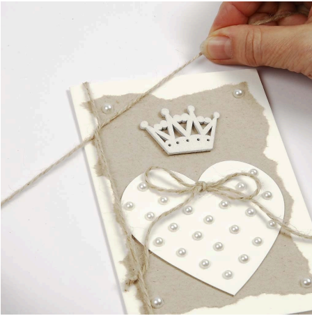
8. Tie a string around the card vertically.