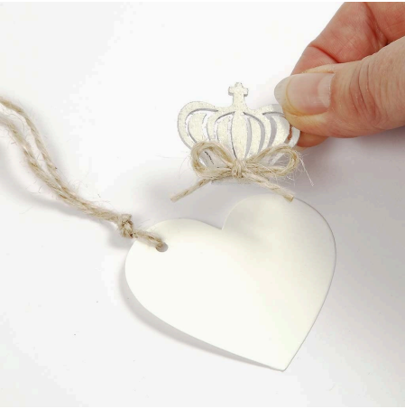
9. Use a small heart as a place card and decorate it with a piece of string, a crown and self-adhesive rhinestone half-pearls.