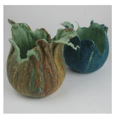
Rinse the pot in clean water. When the pot is finished it must dry with the balloon inside in order to keep its shape.