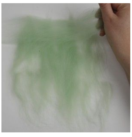
2 ... which cross at right angles.