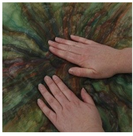
Squeeze the air out of the wool and felt lightly.