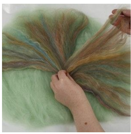
6 Put the fans on top of the circle.