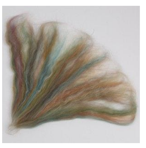
Pull three pieces of approx. 20 cm of the Rainbow Combed Merino Wool. Spread these out like a fan.