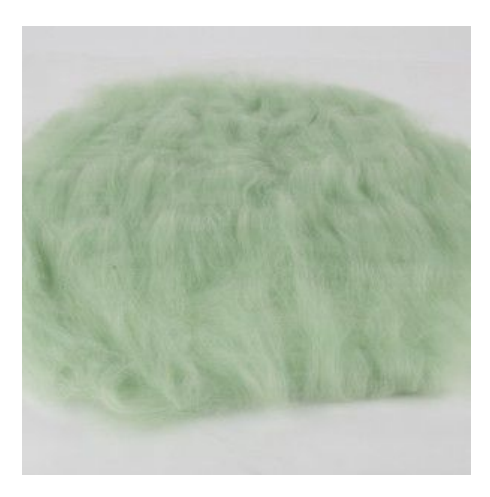
Put 15 g of lime green Merino Wool on top in a circle with a diameter of approx. 40cm. The 15 g should also be distributed over the first circle. Put the wool in several thin layers which cross at right angles.