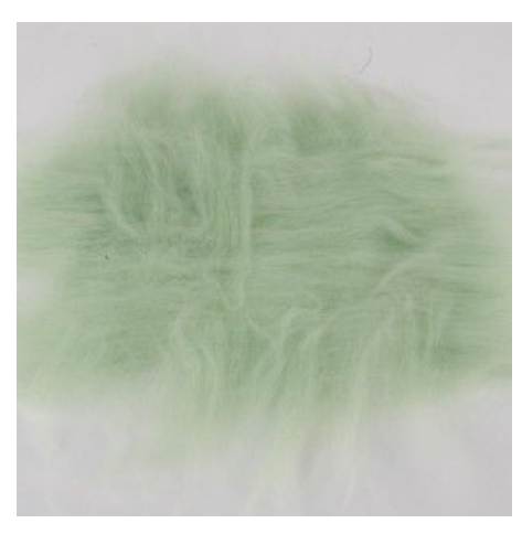
3 ...der krydser hinanden.