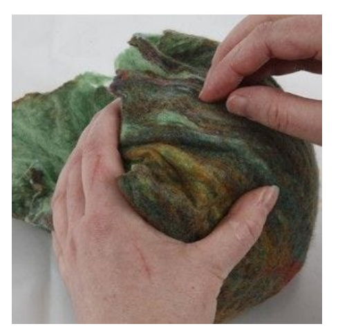
When the wool sticks well together, felt across to gather the wool around the opening of the pot.