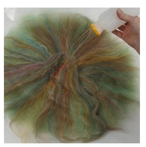
Sprinkle on some water.