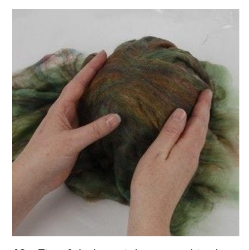
First felt the rainbow wool in the same direction as the fibres.