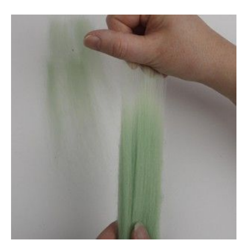
1 Put 10 g of lime green Merino Wool thinly into a circle with a diameter of approx. 20 cm.