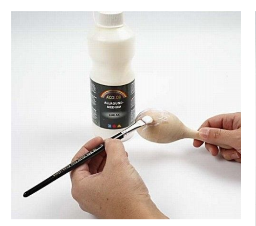
1. Brush the maracas with glue lacquer.