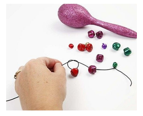
4. Tie some bells onto an elastic cord.