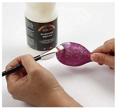
3. Apply another layer of glue lacquer onto the glitter surface.

2. Sprinkle glitter in the wet glue lacquer and let it dry.