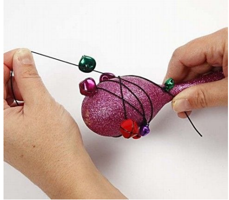
5. Wrap the elastic cord around the maracas.