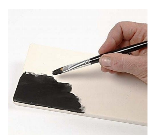
1 Black tile: Paint the art tile with black ceramic paint. Let it dry.