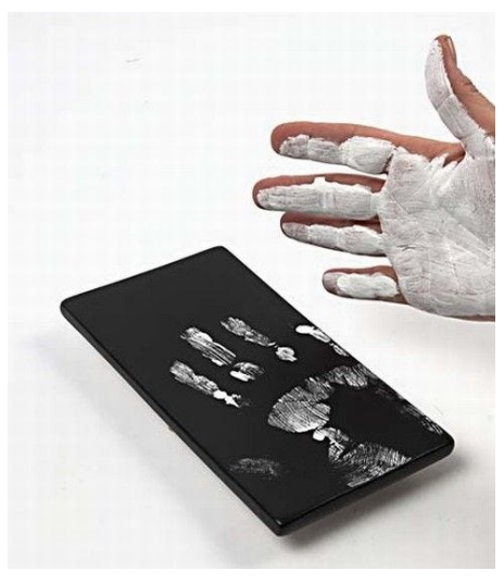
2. Make imprints of feet or hands with white Plus Color.