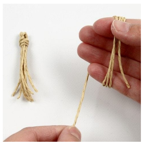
2. Make tassels and tie them onto a piece of string.