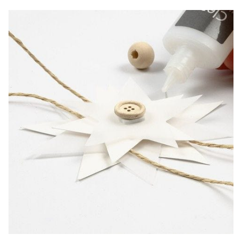
3. Glue on the string with the tassels between the middle layers of the star. Thread on a bead at the end.