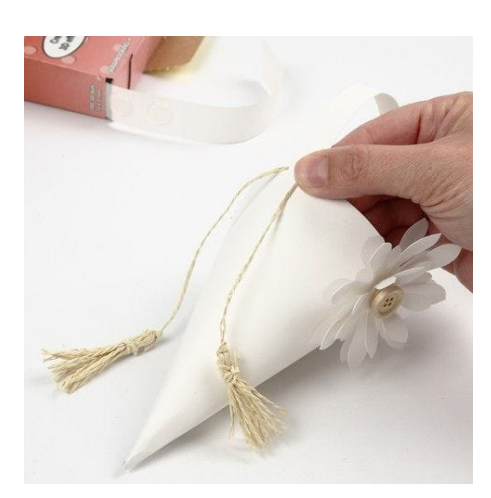
3. Make the tassel and tie it onto the twine first also using Glue Dots and attach this to the cone handle.