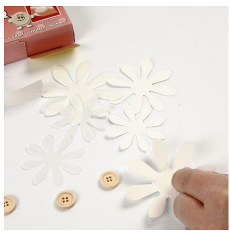
2. Assemble the flower with Glue Dots. Attach the button at the end.