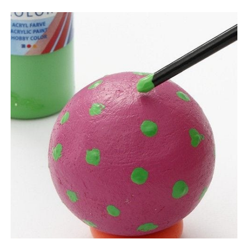
1. Paint compressed cotton balls with Plus Color craft paint. Glue the body onto a Silk Clay "stand".