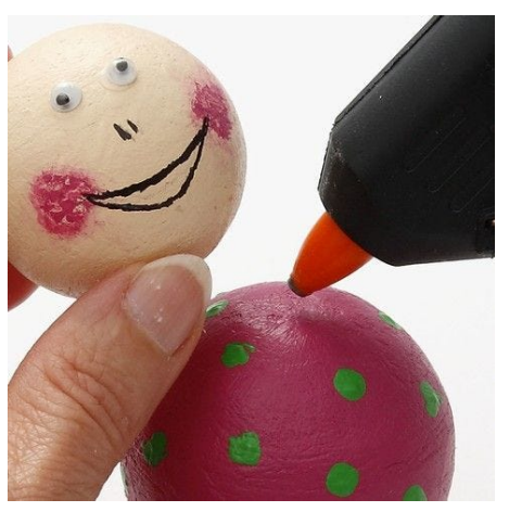
3. Glue the head onto the body using a glue gun.