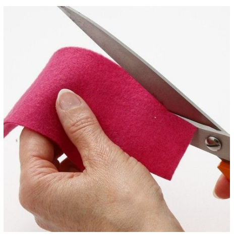
5. Cut out felt for a hat and scarf and glue these onto the pixie with a glue gun or Clear Multi glue gel.