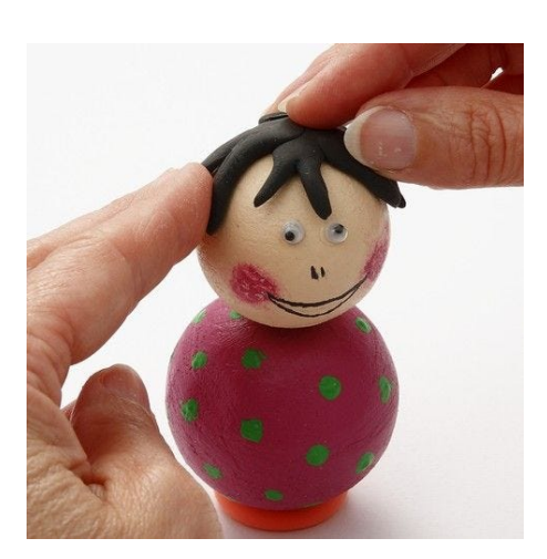
4. Shape hair from Silk Clay.