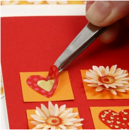
4. Bend the sides of the hearts and flowers upwards.