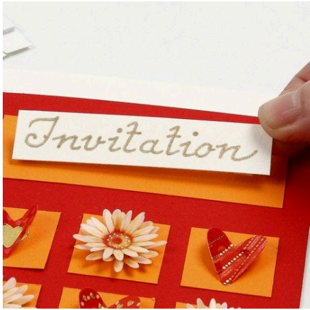
6. Attach the piece of white card onto the piece of orange card with 3D foam pads.