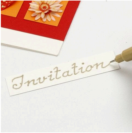
5. Attach a piece 9 x 3cm piece of orange card onto the greeting card with double-sided adhesive tape. Write a text on a piece of white card with a gold marker pen.