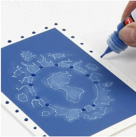
5. Use a Pearl Pen to decorate the greeting card.