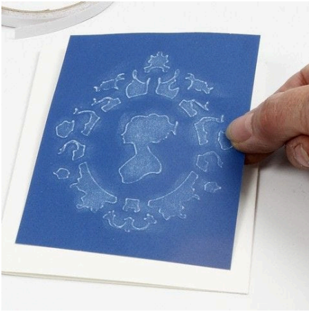
4. Attach the Color Bar paper with the embossed design onto the greeting card using double-sided adhesive tape.