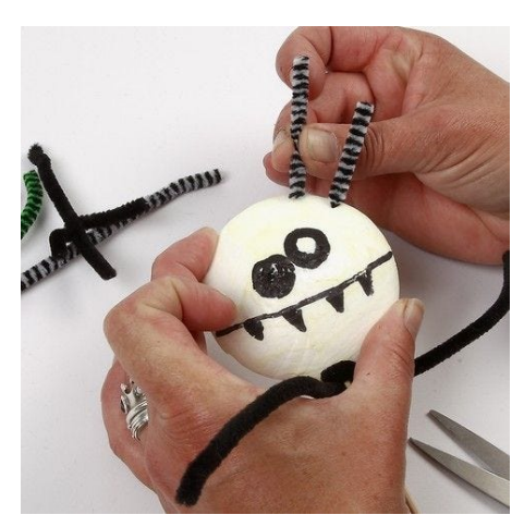
3 Shape and cut pipe cleaners and stick into the polystyrene shape.