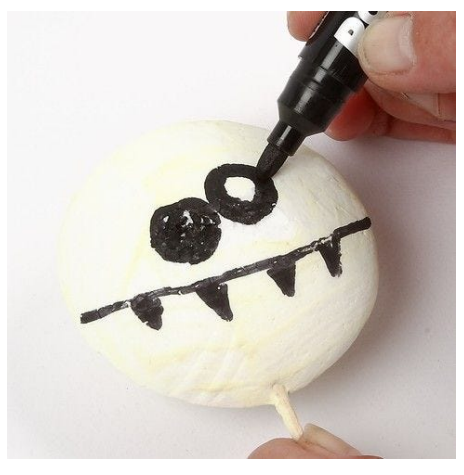
2 Draw the face with a permanent marker or 3D outliner.