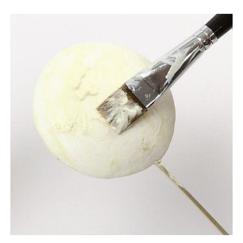
1 Push the polystyrene shape onto a stick and paint several coats of Glowin-the-dark paint.