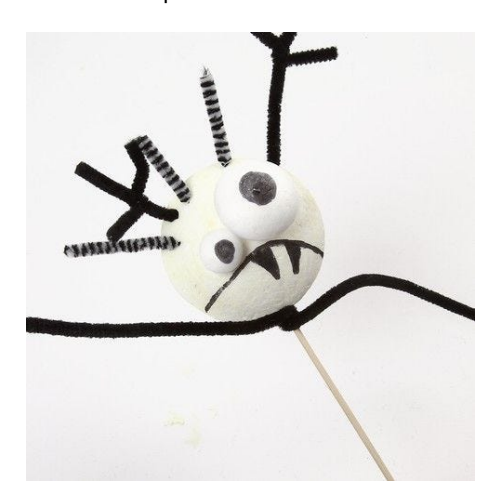
4 Variation: Make the eyes from two small polystyrene balls.