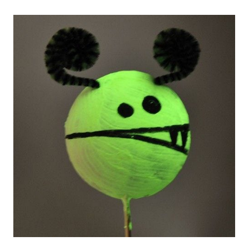
7 An alternative version.