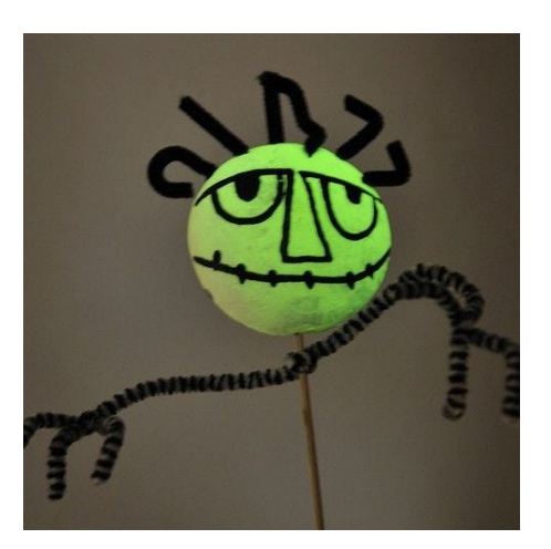
6 An alternative version.