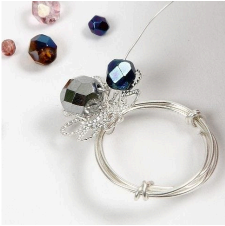
8. Thread the beads onto the wire 1 – 2 – 3 at the time whilst “sewing” up and down through the holes of the bead cap – and around the ring.