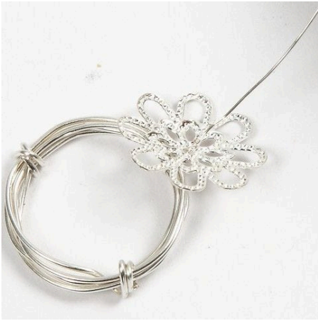
7. Attach the bead cap onto the long end of the silver-plated wire.