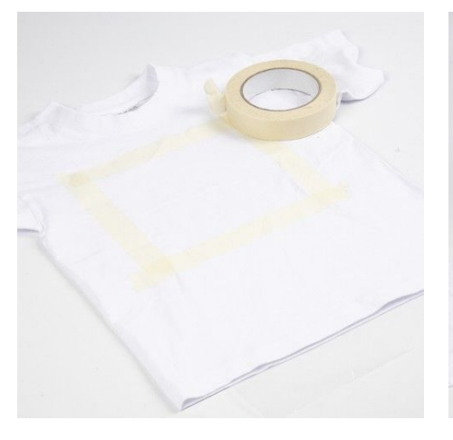
1. Put a newspaper or a piece of plastic inside the T-shirt, protecting the back in order to avoid smudging. Attach masking tape on the front chest area of the T-shirt, marking the area for the decoration.

A T-shirt and a bucket hat painted with Neon Textil Color fabric paint. The print on the T-shirt is made by rolling black fabric paint on a paint roller over a screen stencil.