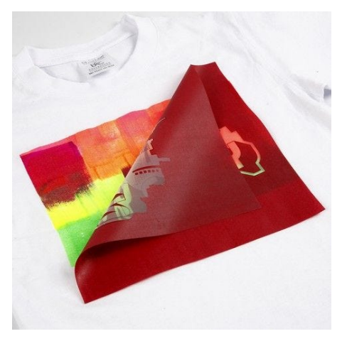
3. Place the screen stencil on top of the T-shirt with the adhesive side facing down onto the T-shirt – and press it down, attaching it firmly.