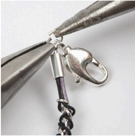
8. Attach an oval jump ring in both end caps and attach a lobster claw clasp in one of the oval jump rings.