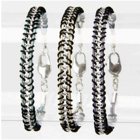
See another example -