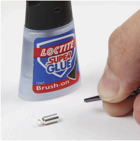
7. Assemble the four ends and glue them in place securely in an end cap.