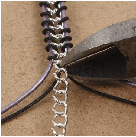
5. Cut off the excess jewellery chain.