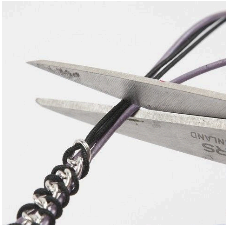
6. Cut the macramé cords and the leather cords leaving them approx. 1cm longer than the chain.