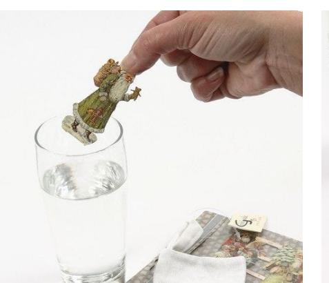
1. Moisten the vintage die-cut with water.

Ready-made textiles for hanging, decorated with vintage die-cuts attached using decoupage lacquer for fabrics.