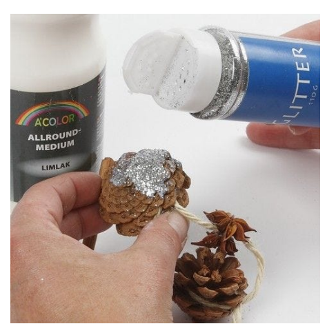
7. Apply a small amount of A-color Allround medium glue lacquer with a brush and sprinkle with glitter.