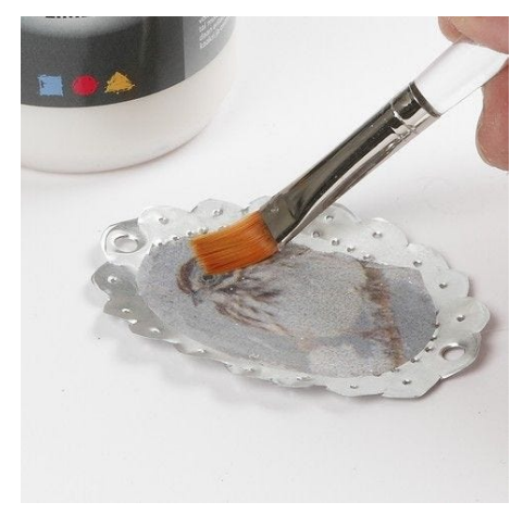
3. Glue a cut-out design from decoupage paper onto the hearts and ovals.