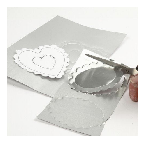
1. Cut out hearts and ovals using the template. Cut these out from stamping foil.