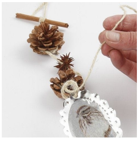
5. Halfway along the piece of flax twing, tie on the oval silver stamping foil oval.