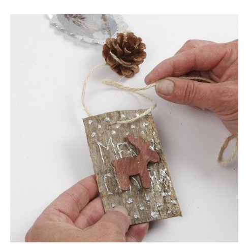
6. Finish with a piece of bark painted with Plus Color craft paint and decorated with glitter and a wood veneer deer.