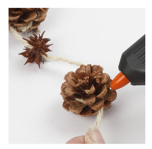
4. Attach and glue cinnamon stickes and pine cones onto the piece of flax twine.