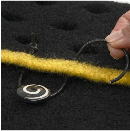
5. Make a fastener from leather cord as shown.