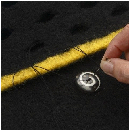
4. Use a piece of mercerised cotton yarn for loosely sewing the horn bead onto the bag.