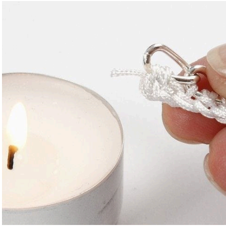
9. Carefully melt the ends.