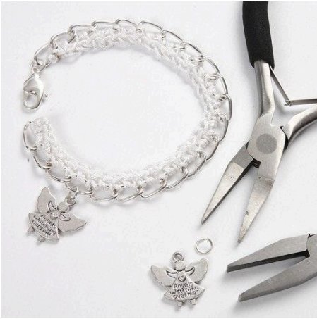
10. Use two pairs of pliers for attaching the charms.