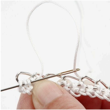
8. Secure the ends.