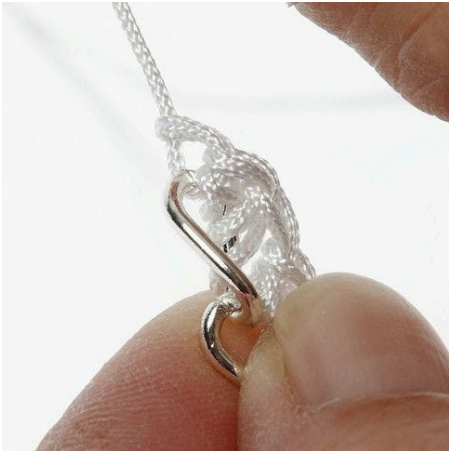
7. Finish the crochet border on the jewellery chain by pulling the cord end through the last stitch.