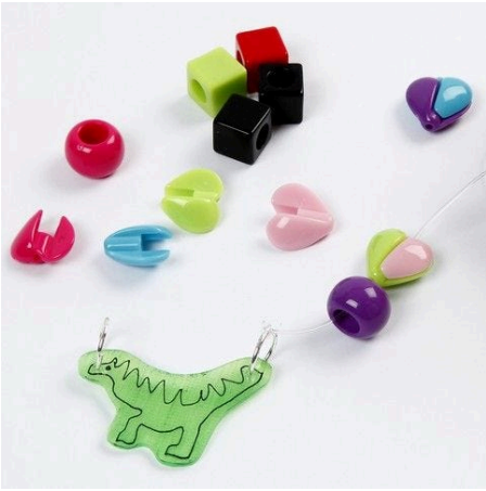
8. Thread heart plastic beads onto the elastic beading cord.