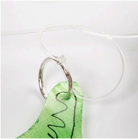
7. Tie a piece of elastic beading cord in each round jump ring.