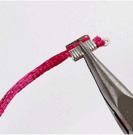
9. Cut a piece of satin cord for the necklace and attach fold-over cord ends onto each end of the satin cord.