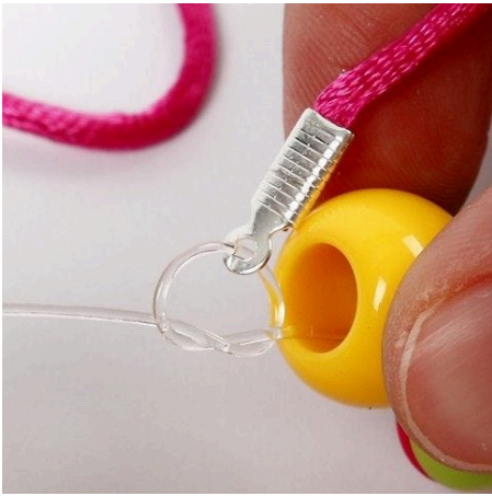
10. Tie the end of the elastic beading cord onto the loops of the fold-over cord ends.