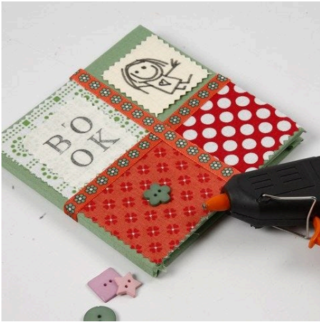
7. Attach buttons according to your own taste using a glue gun.