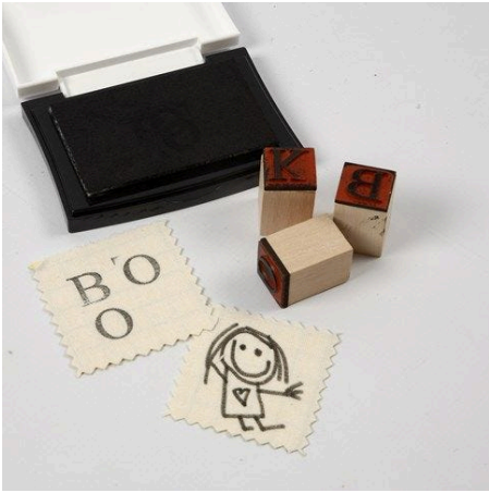
4. Create a text using letters from the foam stamp set that contains the entire alphabet. Apply ink to each stamp by pushing it into the ink pad and then stamp onto the notebook cover. Also draw a design using a textile marker.