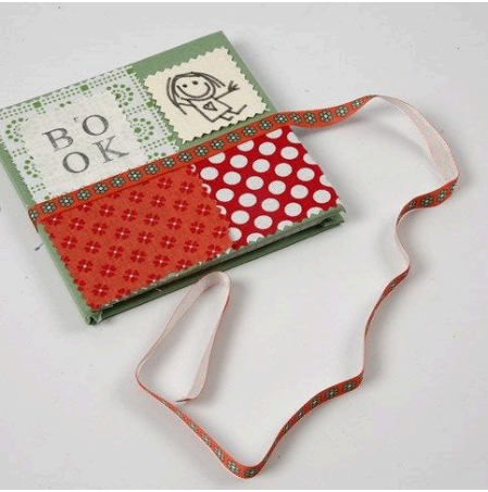
6. Attach decorative ribbons onto the double-sided foil tape in a criss-cross fashion over the joints.