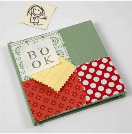
5. Attach the different fabric squares onto the front of the notebook.