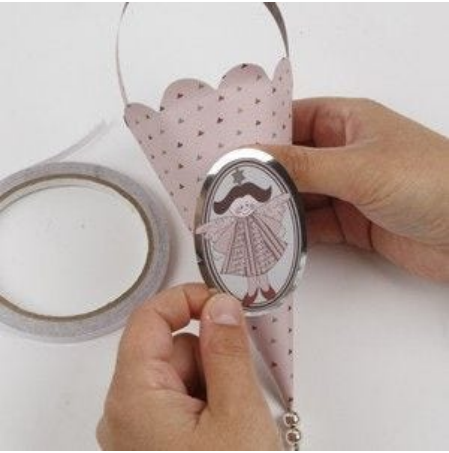
9 Attach the picture to the cone.