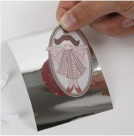
8 Attach the picture onto another piece of paper and cut it neatly round the edge.