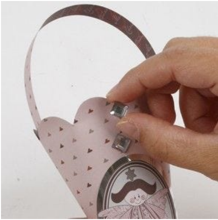
10 Decorate with rhinestones.