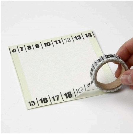
5. Attach Masking Tape and self-adhesive rhinestones to the square piece of card.